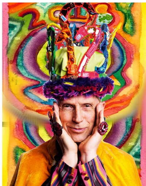
Andrew Logan AMW 2018