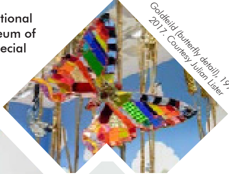
Goldfield (butterfly detail), 1976- 2017.