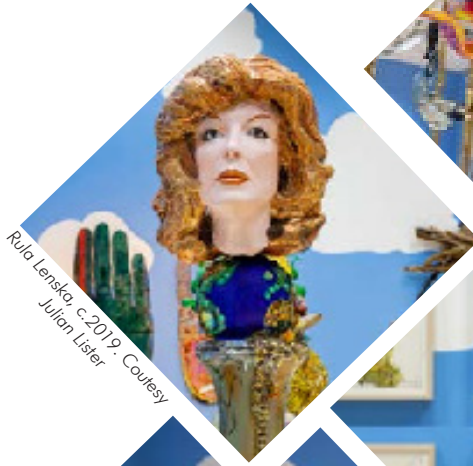
Rula Lenska, c.2019.

Lenders: Arts Council Collection, National Portrait Gallery, Andrew Logan Museum of Sculpture, De Montfort University Special Collections.