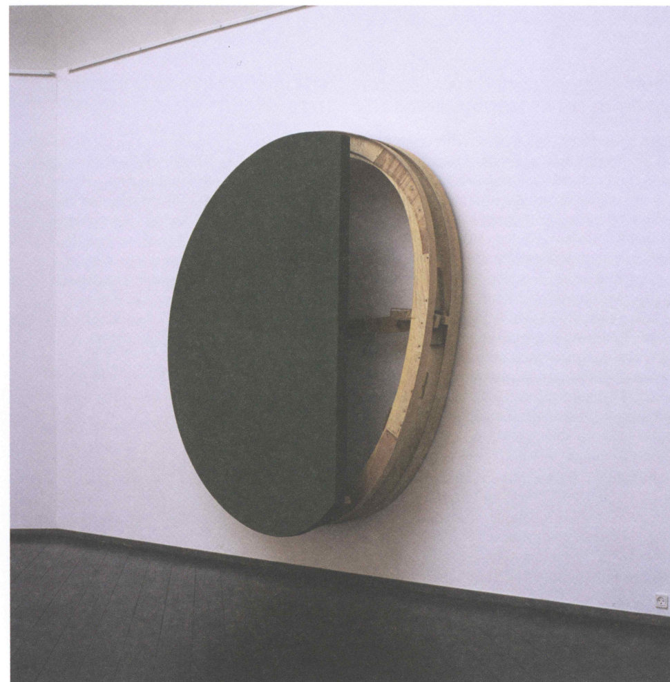
Black & Green Wallspine 2013